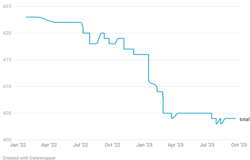
Figure 2. Dynamics of the Composition of the Verkhovna Rada of Ukraine during January 2022–September 2023

and who were absent was growing as regards deputies, which significantly complicates the search for the necessary votes when voting for important bills. When majority votes are insufficient, power rests with other factions or support groups. If, during the first period, the necessary votes were mostly added by pro-Ukrainian opposition parties (European Solidarity, Holos and Batkivshchyna), during the second period, the necessary votes were increasingly added by non-factional people's deputies, the deputy groups "Trust" and "For the Future", as well as deputies of the former opposition pro-Russian faction "Opposition Platform – For Life" (on the basis of which, after its ban, two deputy groups "Platform for Life and Peace" and "Restoration of Ukraine" were formed) (Kontraktovych, 2023). The ruling party "Servant of the People" justifies such cooperation because of the need to find votes for important bills, although such cooperation with deputies from the former pro-Russian party "Opposition Platform – For Life" added decisive votes in only 9% of cases.