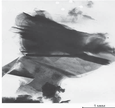
Fig. 5. Electron micrograph of a sample of untreated vermiculite of fired T = 400^{\circ}\text{C} .

As shown by electron microscopic studies of untreated vermiculite calcined at T = 400^{\circ}\text{C} , its full swelling is not observed. And when processing with reagents (the most successful samples were chosen after physico-chemical studies), the similarity of the samples obtained is evident, namely, the unprocessed samples burned at 900^{\circ}\text{C} have the same form as those treated at 400^{\circ}\text{C} with reagents.