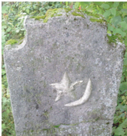
Rare evidence. A tombstone on the Muslim cemetery in Ostroh