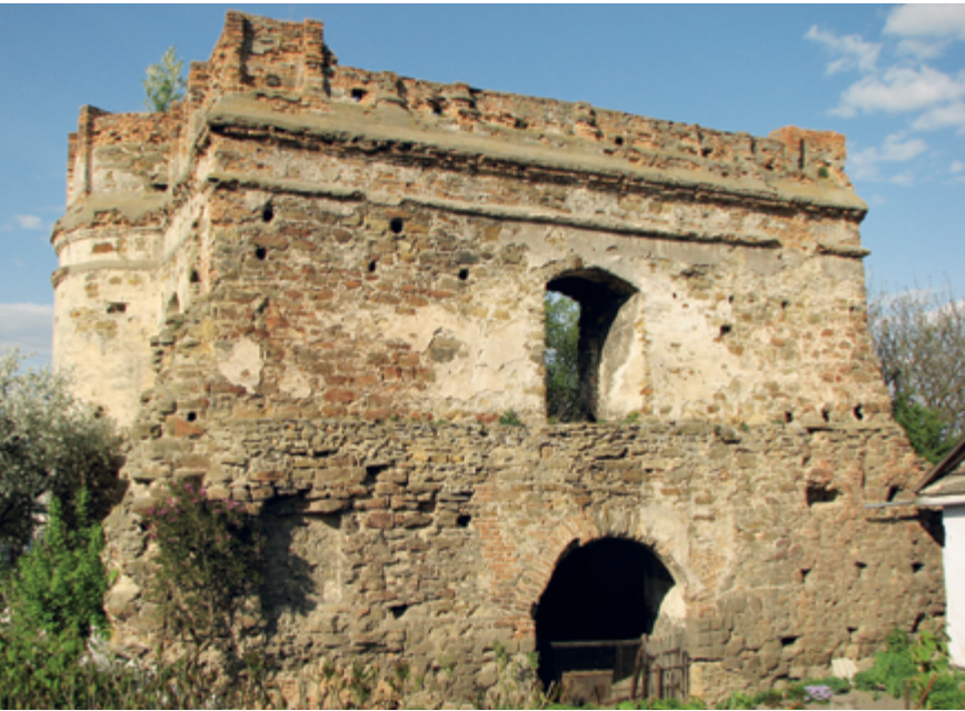
The Tatar tower in Ostroh. The dense Tatar community used to live around it

The origins and the history of the Muslim community in Volyn